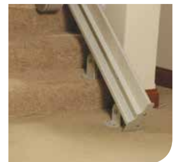
Powder-coated champagne painted rail.